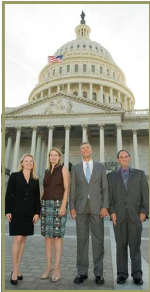
2011 LDAC Discussion Leaders